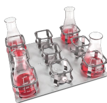
HSP-9/500 BS-010167-NK platform

Platform with tight fit clamps for flasks.