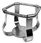
HSC-500 BS-010167-JK clamp

Tight fit clamp 250 ml - Ø85 mm for UP-168