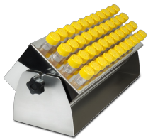
TR-44/15 BS-010135-LK rack

Double-sided adhesive strips. SPML is compatible with UP-168 platform, that fits both on PSU-20i orbital shaker and in ES-20/60, ES-20/80 Shakers-Incubators.