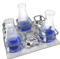
HSP-6/1000 BS-010167-LK platform

Flat platform with non-slip silicone mat can accommodate various low profile containers.