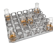
HSP-30/100 BS-010167-KK platform

Platform with tight fit clamps for flasks.