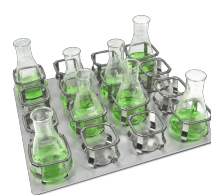
HSP-16/250 BS-010167-MK platform

Platform with tight fit clamps for flasks.