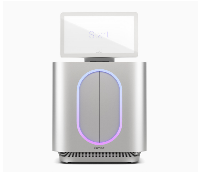
Figure 1: MiSeq i100 and MiSeq i100 Plus Sequencing Systems— Illumina innovation continues to broaden access to NGS with benchtop systems designed for simplicity and speed.

At Illumina, customer experience is at the center of every innovation, making it as easy as possible to prepare libraries, sequence, and analyze data. Every aspect of the MiSeq i100 Series workflow is optimized to minimize the time and resources required to complete projects (Figure 2). The MiSeq i100 and MiSeq i100 Plus Systems offer a simplified workflow with run setup complete in only three steps and under 20 minutes. Load-and-go reagent cartridges and consumables are shipped and stored at